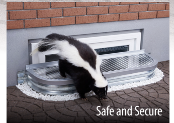
Safe and Secure